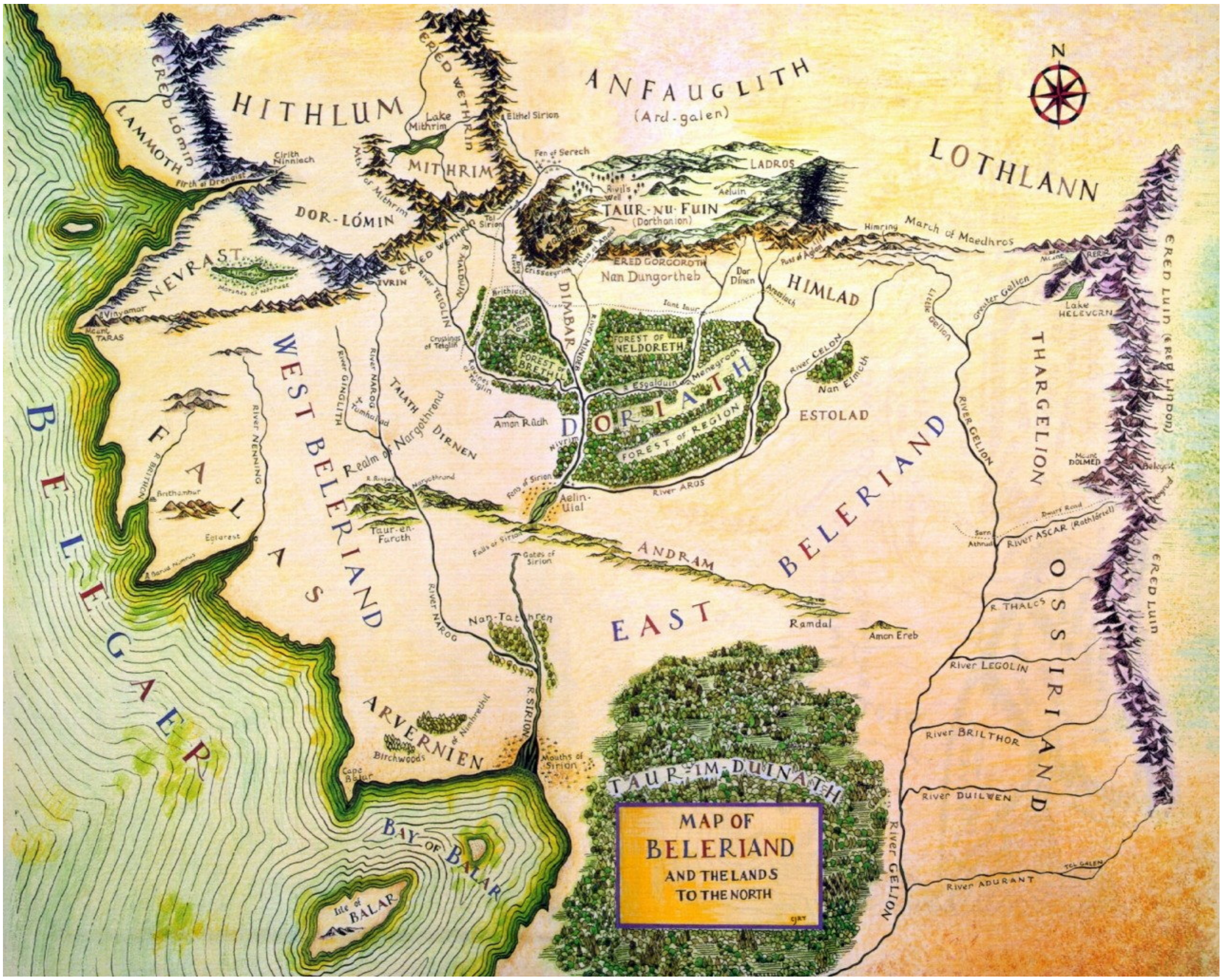
MAP OF BELERIAND AND THE LANDS TO THE NORTH